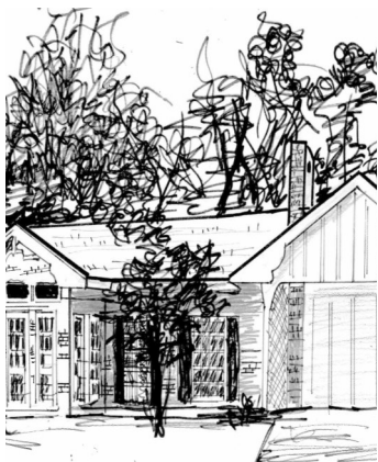
The Ammons Home

Elegant two story home built in 2011 by Montes Homes. Inspired with Mediterranean flair the home features stone and stucco elevations along with dramatic arched entryway and stair case, five bedrooms, four and one half baths, formal study, dining room and the theatre room over the Porte cache. Located in Broadmoor subdivision on two lots the home also has many custom features such as commercial grade stainless steel appliances, hardwood floors, granite in the kitchen and baths, along with oversized closets throughout. Home was definitely built with family usage in mind.