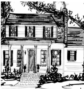
The Rust Home

This downtown office and loft was bought by the Clardy's with plans of renovating the existing structure to be utilized as both a law office space and a loft apartment. The original brick structure was built sometime in the 1890s and has seen many modifications most notably following the downtown fire of 1984. The first and second floors are utilized primarily for the law practice of Clardy Davis & Knowles while the third floor is used as the living quarters of the Clardys. The third-floor balcony, affectionately dubbed "The Ledge" provides a wonderful view of Nacogdoches and a fun place to enjoy all the parades and festivities downtown Nacogdoches has to offer.