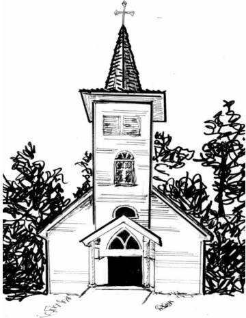
Sacred Heart Catholic Church