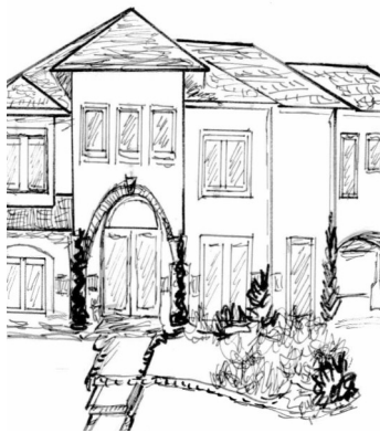
The Ash Home