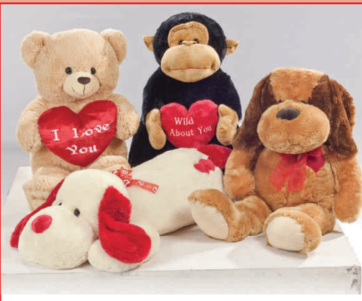
Valentine Giant Animal Plush Select Varieties, 40 Inch, 1 ct