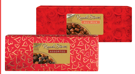
Russell Stover Valentine Candy Select Varieties, 8.25-12 oz Box