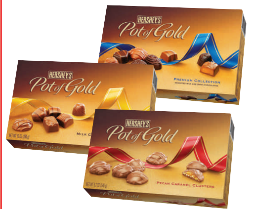
Hershey's Pot of Gold Valentine Candy Select Varieties, 8.7-10 oz Box