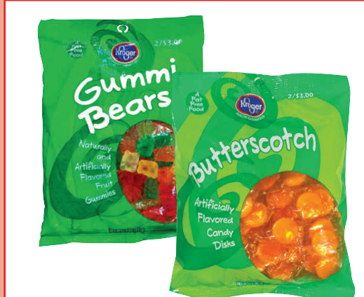
Kroger Candy Select Varieties, 5-18 oz Bag