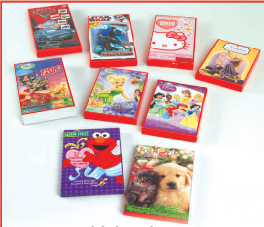
Valentine Exchange Cards Select Varieties & Sizes

Limited to Stock on Hand. Selection May Vary By Store.