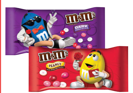
M&M's Candy Select Varieties, 9.9-12.6 oz Bag