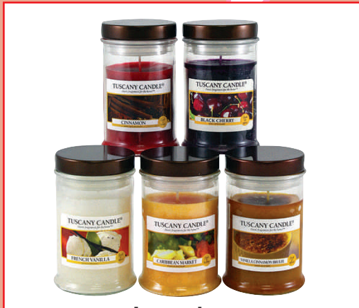
Langley Tuscany Candle Select Varieties, 3 oz