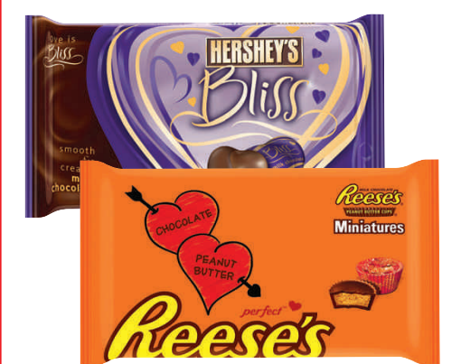
Hershey's or Reese's Valentine Candy Select Varieties, 8.8-11 oz Bag