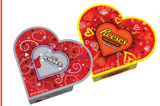
Hershey's Kisses or Reese's Peanut Butter Hearts Candy Select Varieties, 0.93-2.4 oz