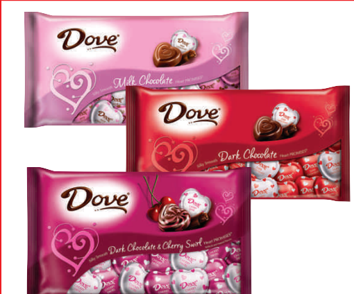
Dove Chocolate Valentine Candy Select Varieties, 7.94-9.5 oz Bag