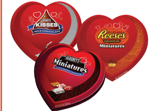
Hershey's, Reese's or York Miniatures Valentine Candy Select Varieties, 8 oz Heart Box