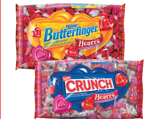
Nestlé Crunch or Butterfinger Hearts Candy Select Varieties, 8 oz Bag